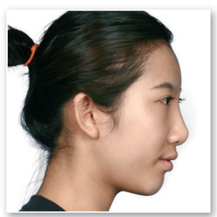
Before and after treatment to nose to mouth lines with Restylane Perlane™