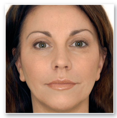
A combination of Restylane treatments comprising lip enhancement, nose to mouth lines, marionette lines and mid face skin revitalisation.