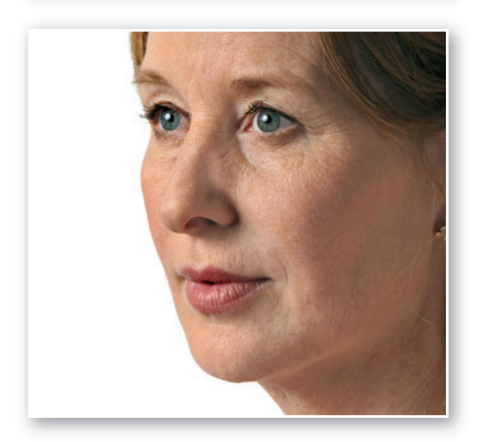
Before and after pictures following a course of 3 Restylane Vital Light treatments