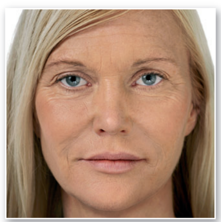
A combination of Restylane treatments comprising glabella, cheek enhancement, nose to mouth lines, lip enhancement and marionette lines.