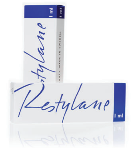
Ask for Restylane by name.

For more information about Restylane and to find a Restylane expert near you call 0800 015 5548 or visit